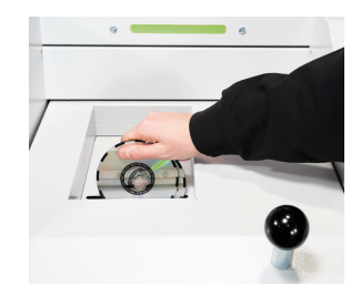
Thin optical, magnetic and electronic data media can be shredded comfortably and quickly using the input slot.