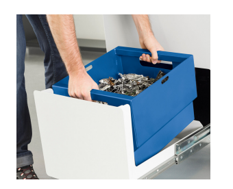
The waste container can be easily removed and emptied.