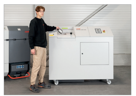
For decentralised destruction

The large and clearly visible LED display enables the continuous input of media at a comfortable working height.